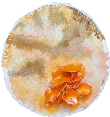
Title: Orange Mycena,

Recipe: blueberries, coffee, carrots, mica minerals, mycelium and salt on watercolor paper made from post consumer waste, 12/4/21.