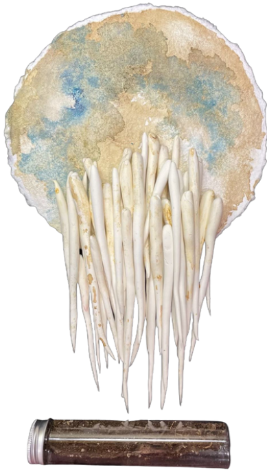
Title: Lion's Mane

www.T6DH.com The 6 Directions of Healing