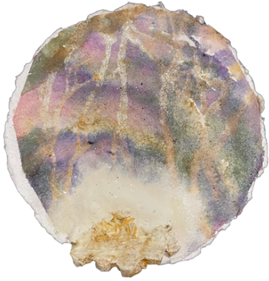
Title: Pink Turkey Tail