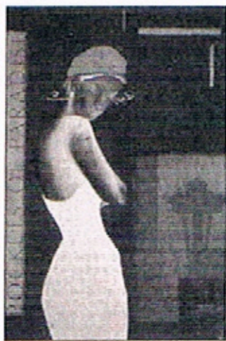
Above: "Pause" (left); "Pockets of Paradise" (right). Below: "Pleasure." All pieces oils & collage.